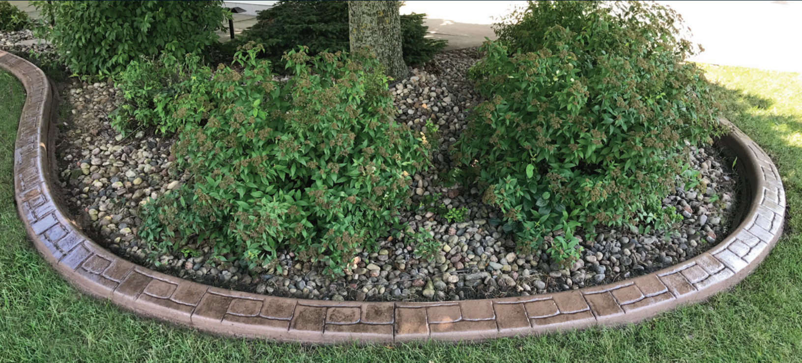
STYLE: Castle Rock